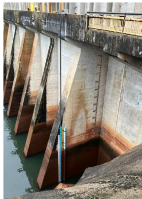
Dam Water Monitoring