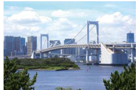
Figure 2. Rainbow Bridge [1990-1994], Chodai (Client: Metropolitan Expressway Company Limited)