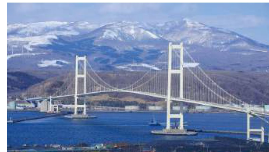
Figure 3. Hakucho Bridge [1988-1997], Chodai (Client: Ministry of Land, Infrastructure, Transport & Tourism)