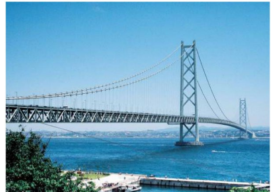
Figure 1. Akashi Kaikyo Bridge [1989-1999], Chodai (Client: Honshu-Shikoku Bridge Authority)

Chodai Co., Ltd. is a consulting firm headquartered in Tokyo, Japan, and the largest company of the PDT group. Chodai was established by 13 bridge engineers in 1968 with the aim of forming a group specialized in long-span bridge design. Chodai has since expanded its business and developed into an overall construction consulting company, and we are today involved in projects ranging from project planning to operation and create new projects by providing high-quality services to society.