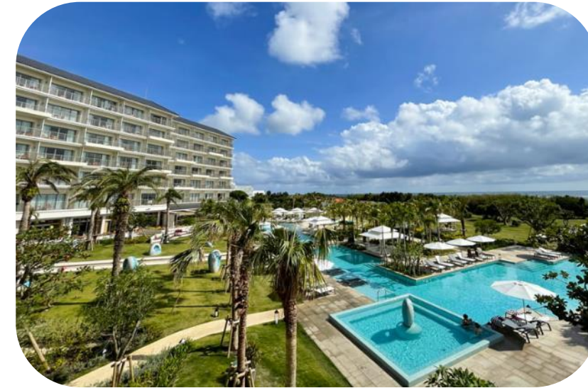
@ANA Intercontinental Ishigaki Resort