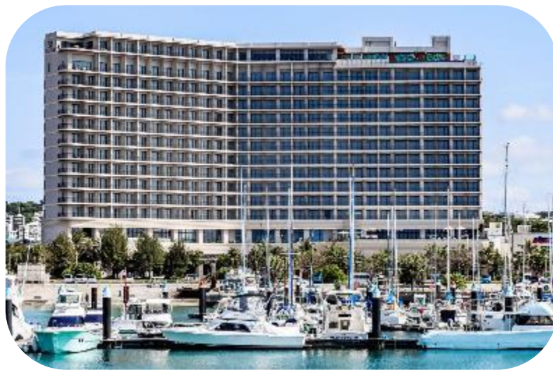
@Ginowan Prince hotel Ocean view