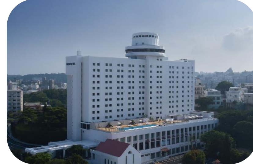
@NOVOTEL OKINAWA NAHA