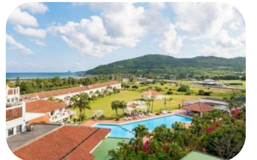
@Resort Hotel Kume Island