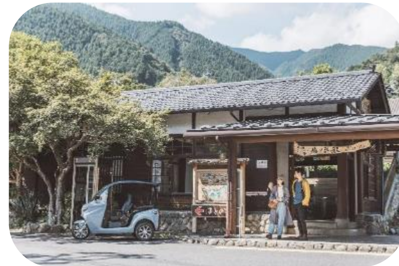
@ Okutama JR Hatonosu Station