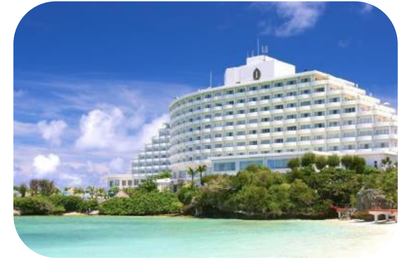
@ANA Intercontinental Manza Beach Resort