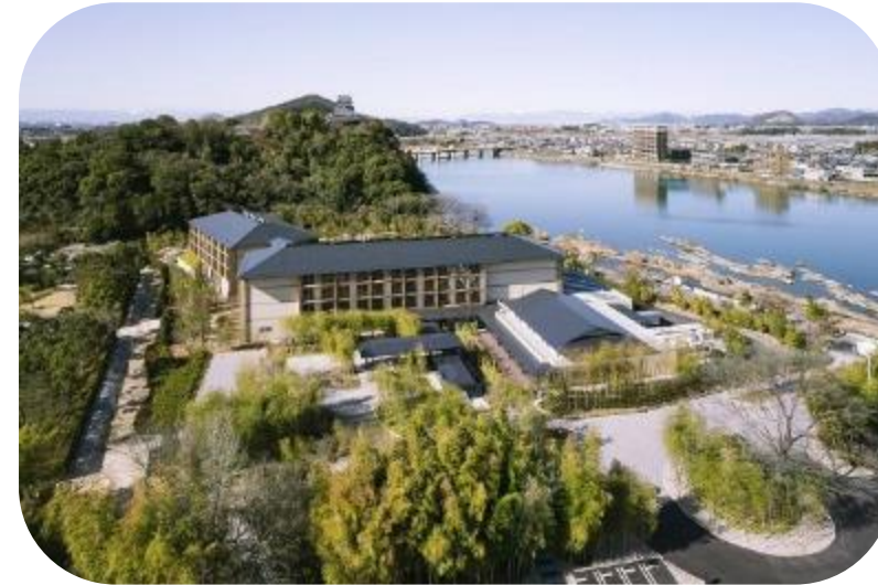
@Hotel Indigo Inuyama