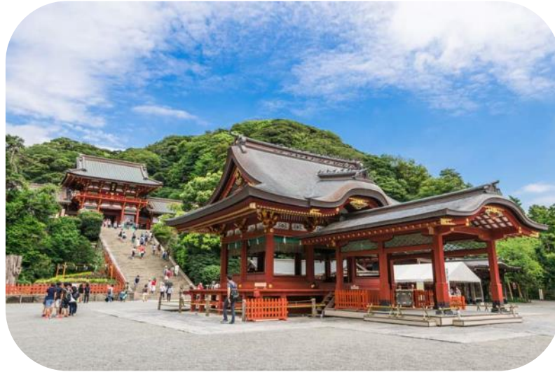
@Kamakura JR Kamakura Station